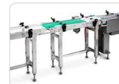
Automatic feeder for trays