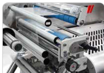
Reel holder with motorised film unwinding