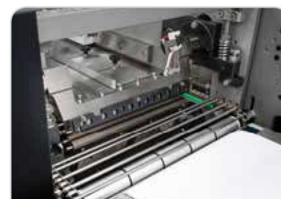
Motorized rollers and convex seal jaws