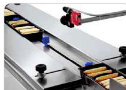
Photocell control for "No Product - No Bag" function