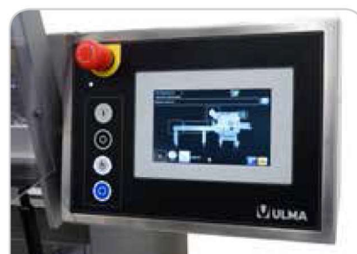
7" graphical touch screen